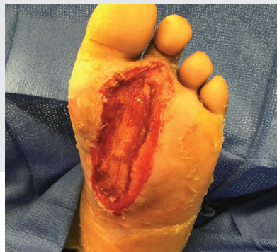
Post debridement pre graft application.