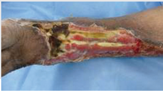
Pre-debridement of foot.

The SonicOne O.R. provides surgeons a safe and effective means of surgical soft and hard tissue management. Utilizing low frequency, high intensity ultrasound, the SonicOne O.R. titanium tips vibrate at 22.5 kHz. This precise vibration creates mechanical energy that is transferred to tissue, causing molecules to oscillate. Micro-sized gas bubbles created in tissue and surrounding fluids create bubbles that collapse (implode), which results in destruction of tissue close to the bubbles. This transient cavitation emulsifies devitalized tissue while the membranes of healthy tissue simply move with the oscillation.