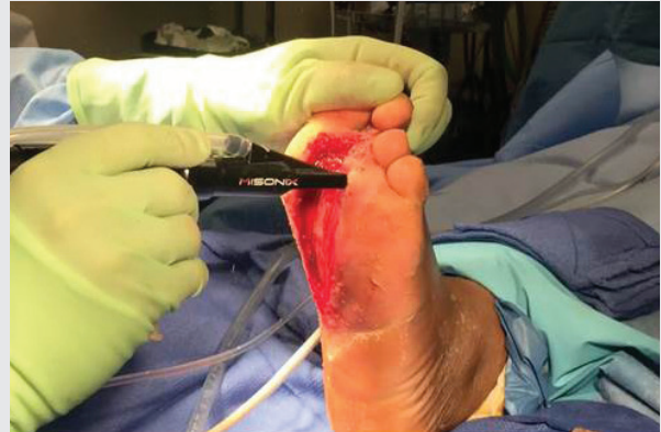
Top-down debridement by utilizing SonicOne.

SonicOne® O.R. utilizes ultrasonic technology in the form of a debridement modality which provides safe and effective removal of all nonviable tissue while safely preserving healthy structures. Sharp and other debridement techniques often result in inadvertent resection of viable tissue planes. The precision available with the SonicOne OR allows for surgical debridement layer by layer from superficial to deep while protecting underlying viable tissues.