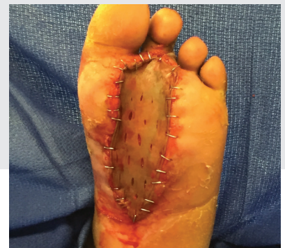
Post graft placement.