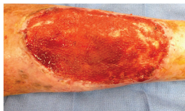
Post-debridement using SonicOne with SonicVac.