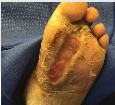
Pre-debridement of foot ulcer.

The therapeutic effects of low frequency ultrasound on wound bed preparation and healing is well documented in the literature. Acoustic micro-streaming and cavitation are the principal effects that drive the cascade of healing activity. Acoustic streaming has been shown to alter cell membrane permeability and second messenger activity, which in turn may result in increased protein synthesis, degranulation of mast cells, and increased production of growth factors. It has been shown that patients within a study treated with SonicOne Ultrasound for recipient site wound bed preparation with subsequent skin graft have a 90% take of split thickness skin graft. 1