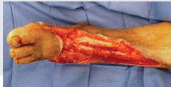
Post-debridement using SonicOne with SonicVac.