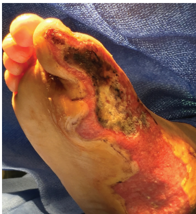
Pre-debridement of fourth degree burn to right foot.

SonicOne has demonstrated reduced blood loss when compared to standard excision methods. 2