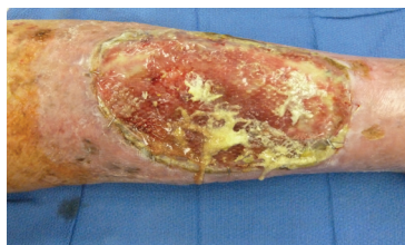
Pre-debridement of tibia.

"Post-treatment a log 5 reduction in bacterial count was seen as a result of the low frequency ultrasonic debridement. Three of the five samples post-treatment showed a bacterial count of zero. The cultures and quantitative bacterial cultures indicate the ability for SonicOne ultrasonic debridement to reduce bacterial load in a variety of wound types and with a broad spectrum of bacteria present." 1